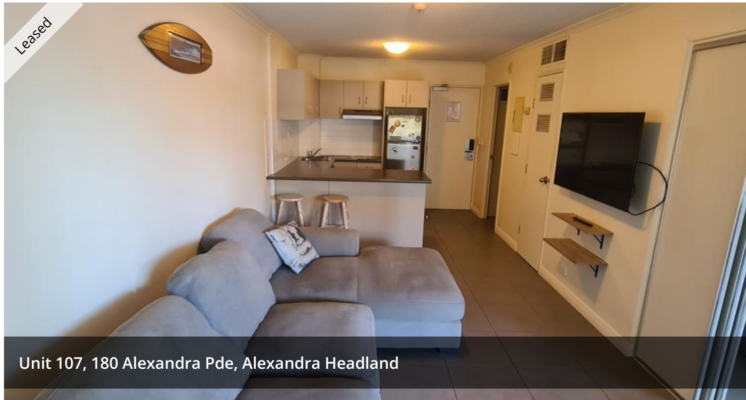
Unit 107, 180 Alexandra Pde, Alexandra Headland