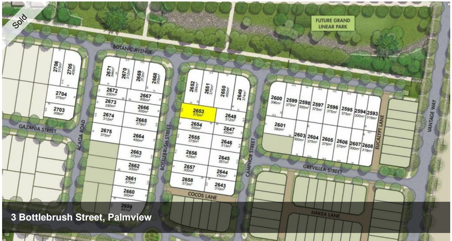
3 Bottlebrush Street, Palmview