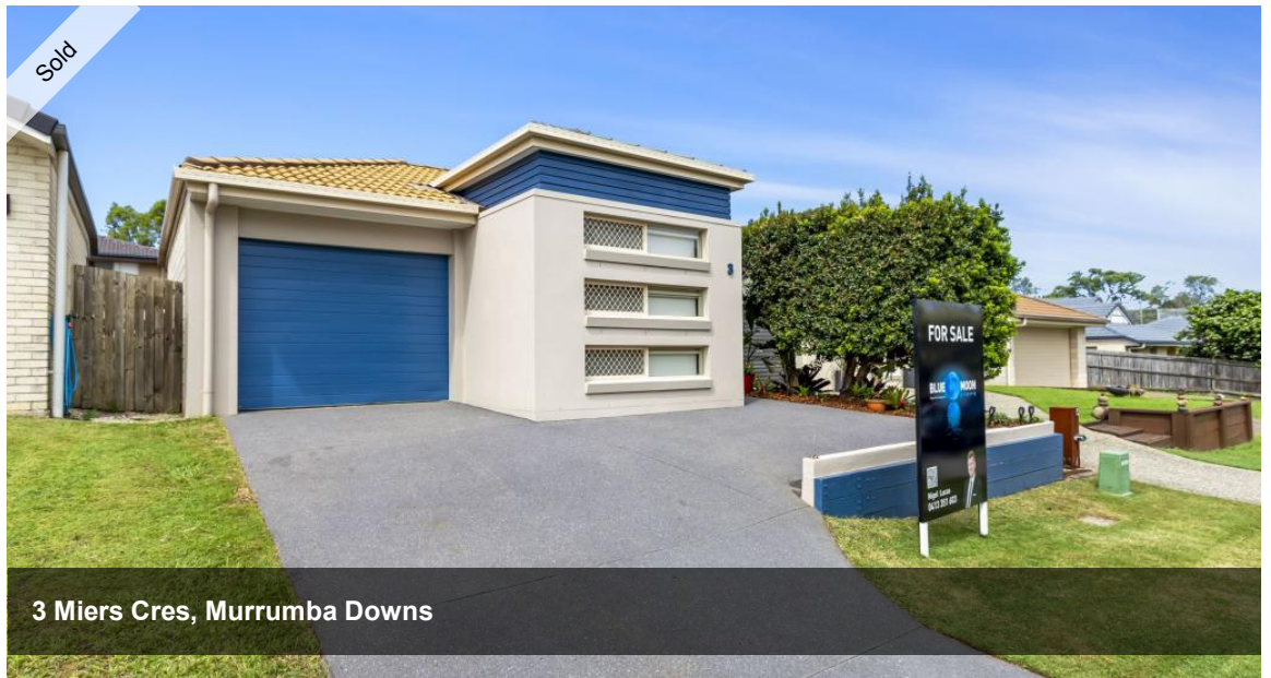
3 Miers Cres, Murrumba Downs