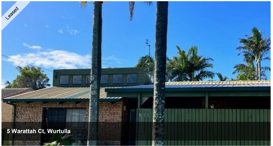
5 Warattah Ct, Wurtulla