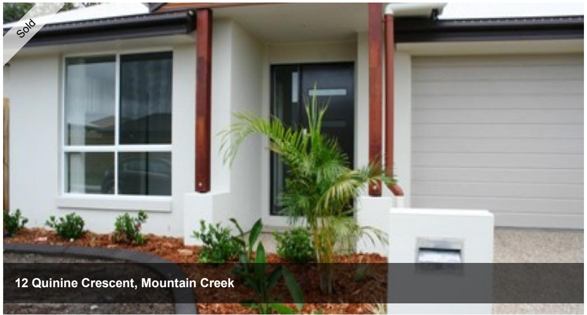
12 Quinine Crescent, Mountain Creek