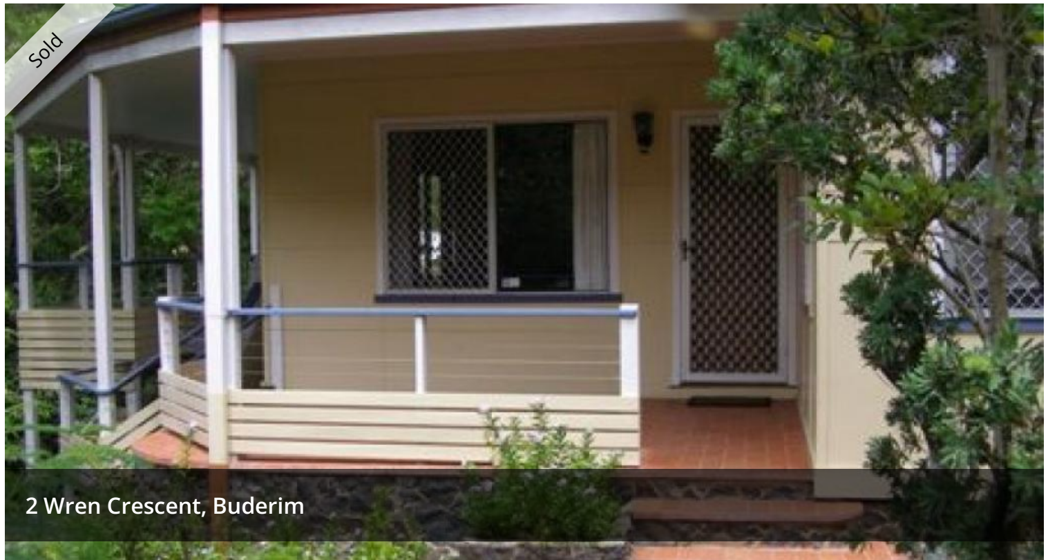
2 Wren Crescent, Buderim