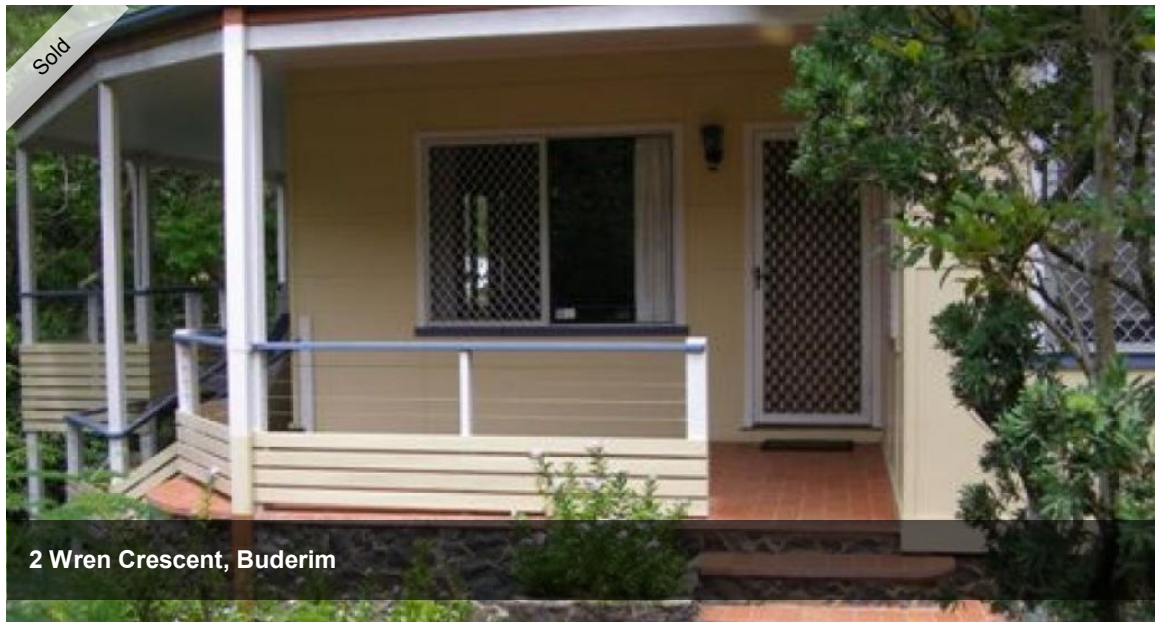
2 Wren Crescent, Buderim