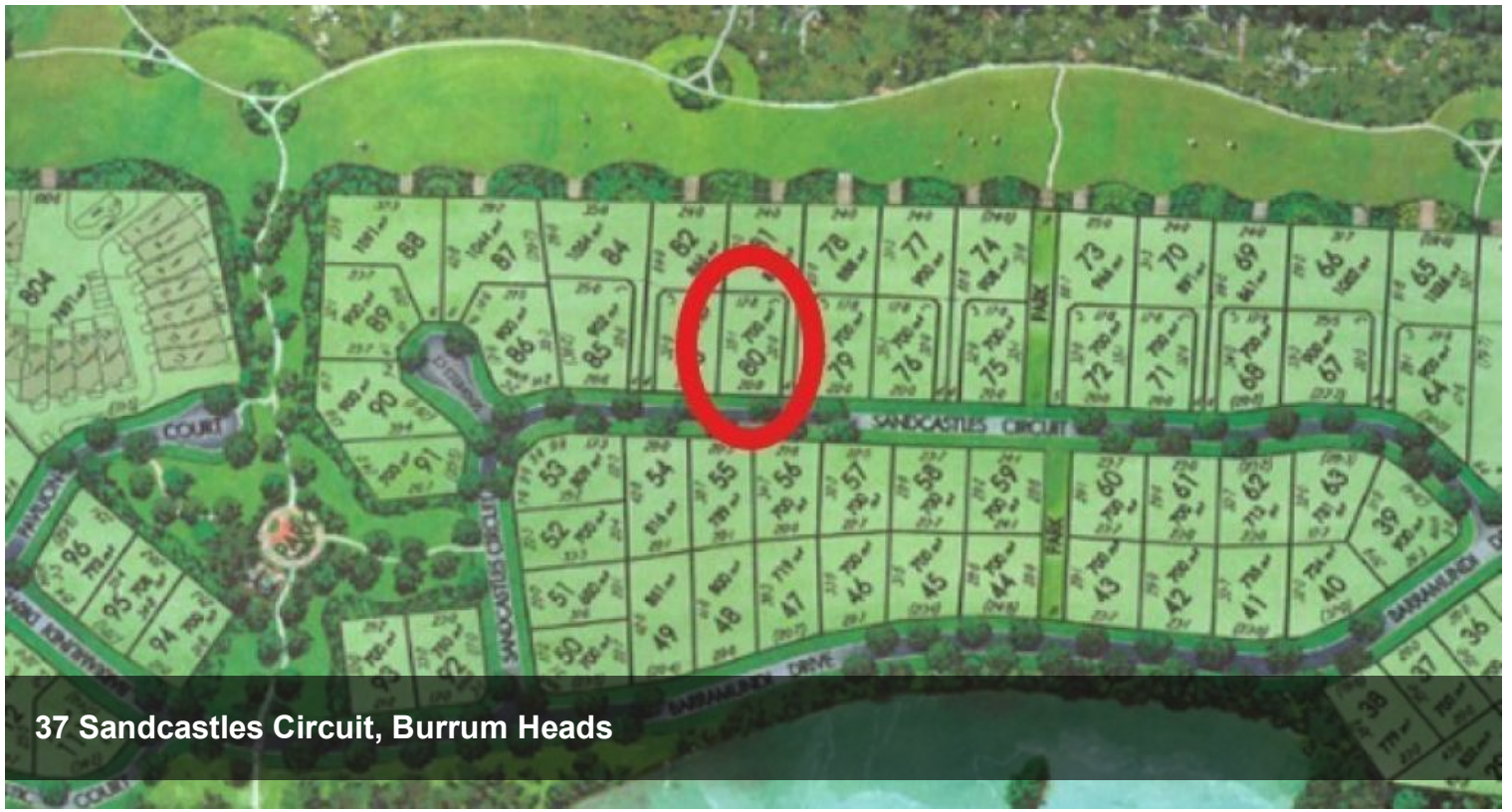
37 Sandcastles Circuit, Burrum Heads