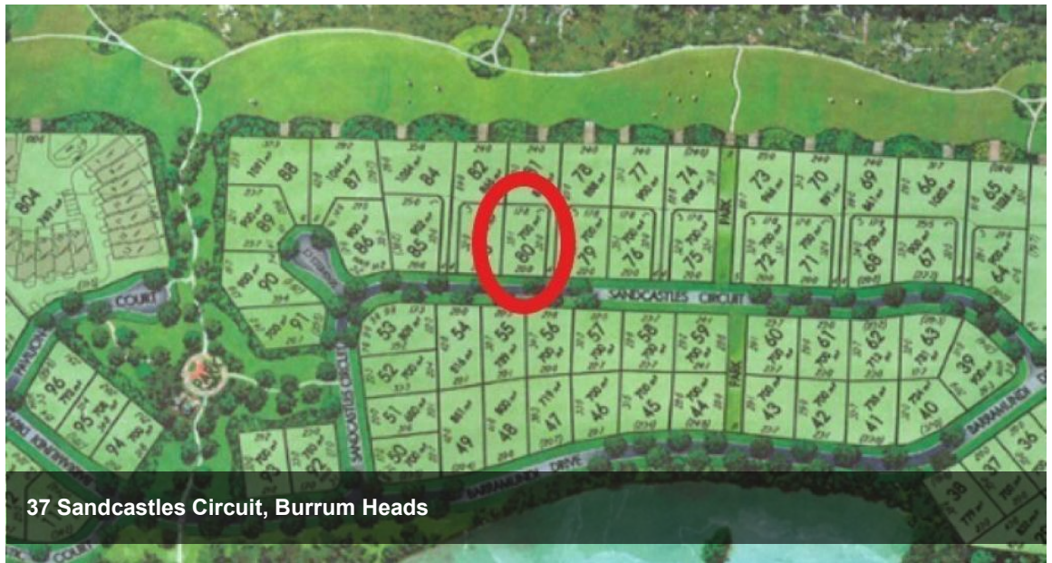
37 Sandcastles Circuit, Burrum Heads