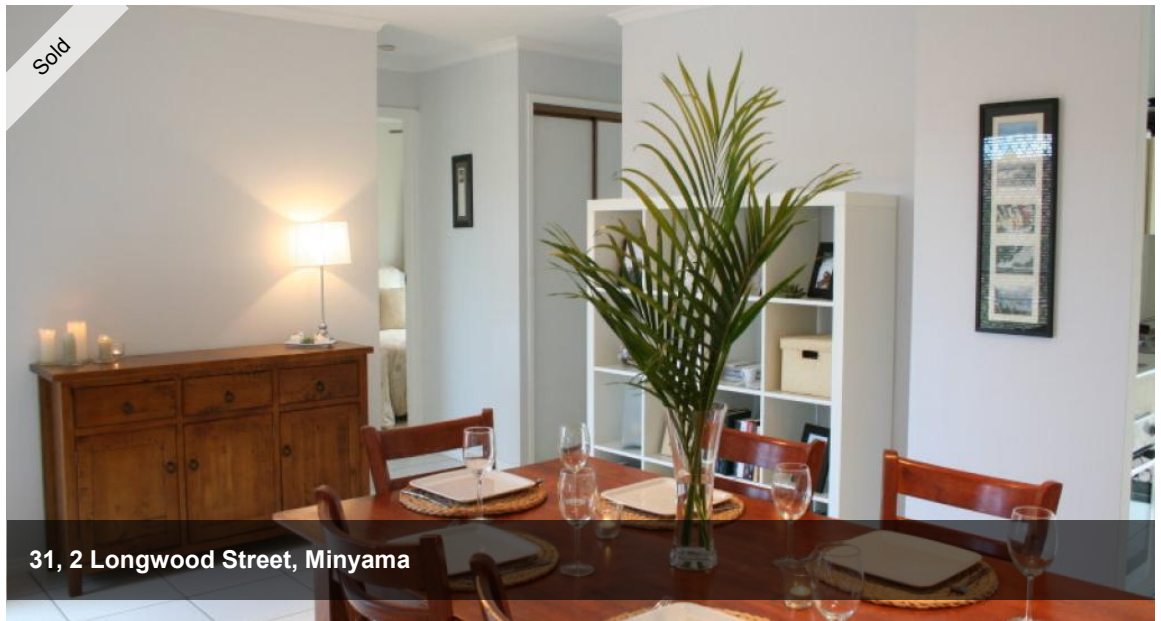
31, 2 Longwood Street, Minyama