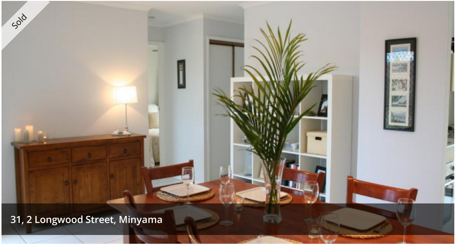
31, 2 Longwood Street, Minyama