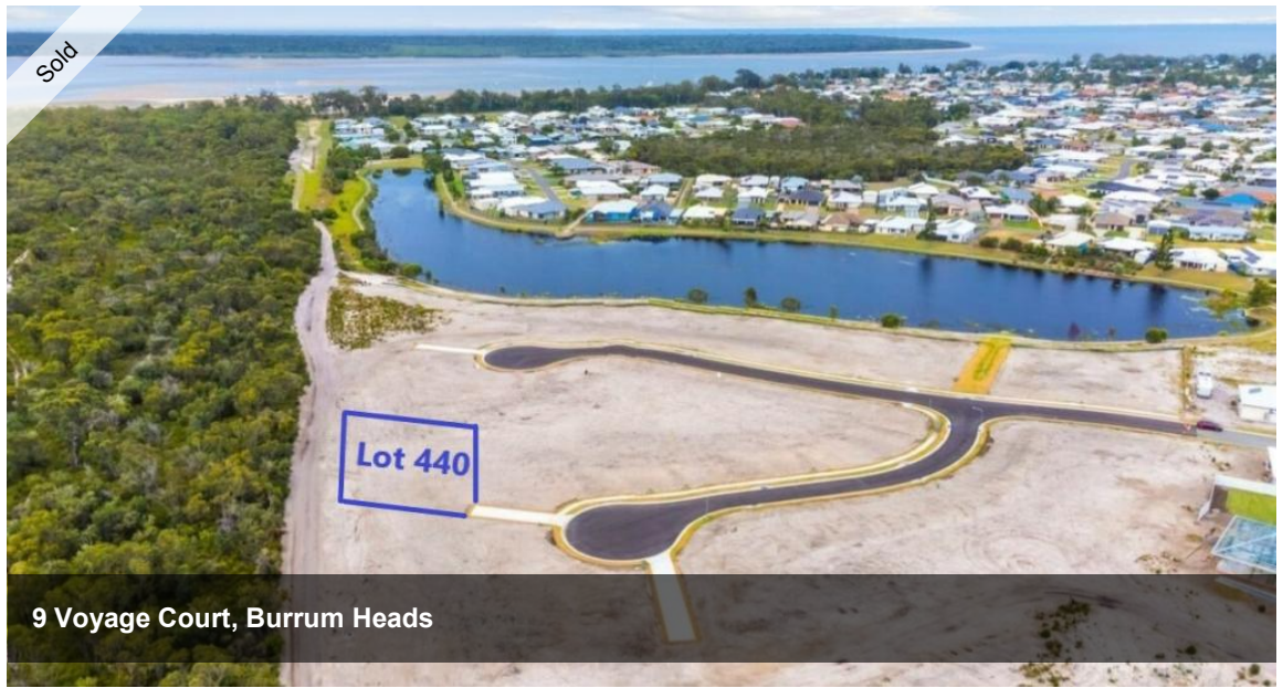
9 Voyage Court, Burrum Heads