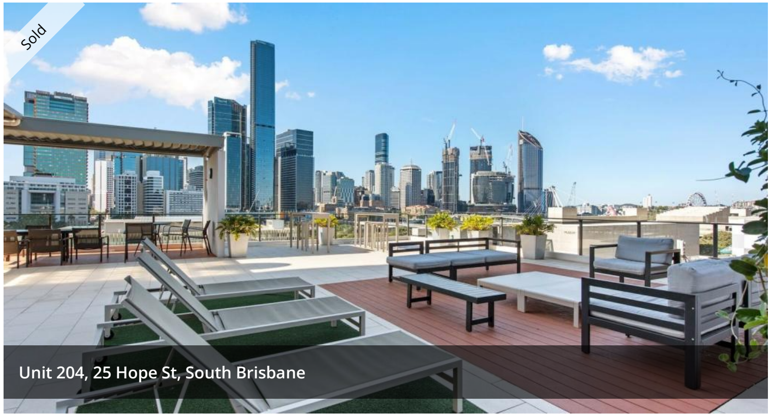
Unit 204, 25 Hope St, South Brisbane