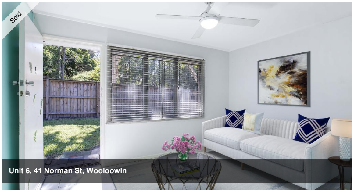
Unit 6, 41 Norman St, Woolloowin