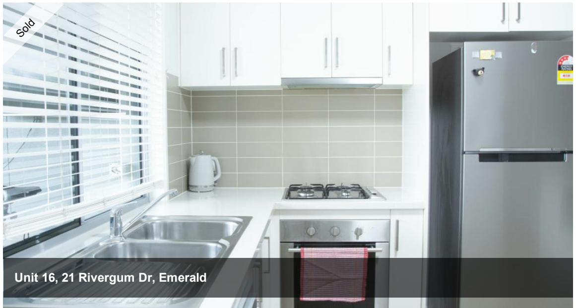
Unit 16, 21 Rivergum Dr, Emerald