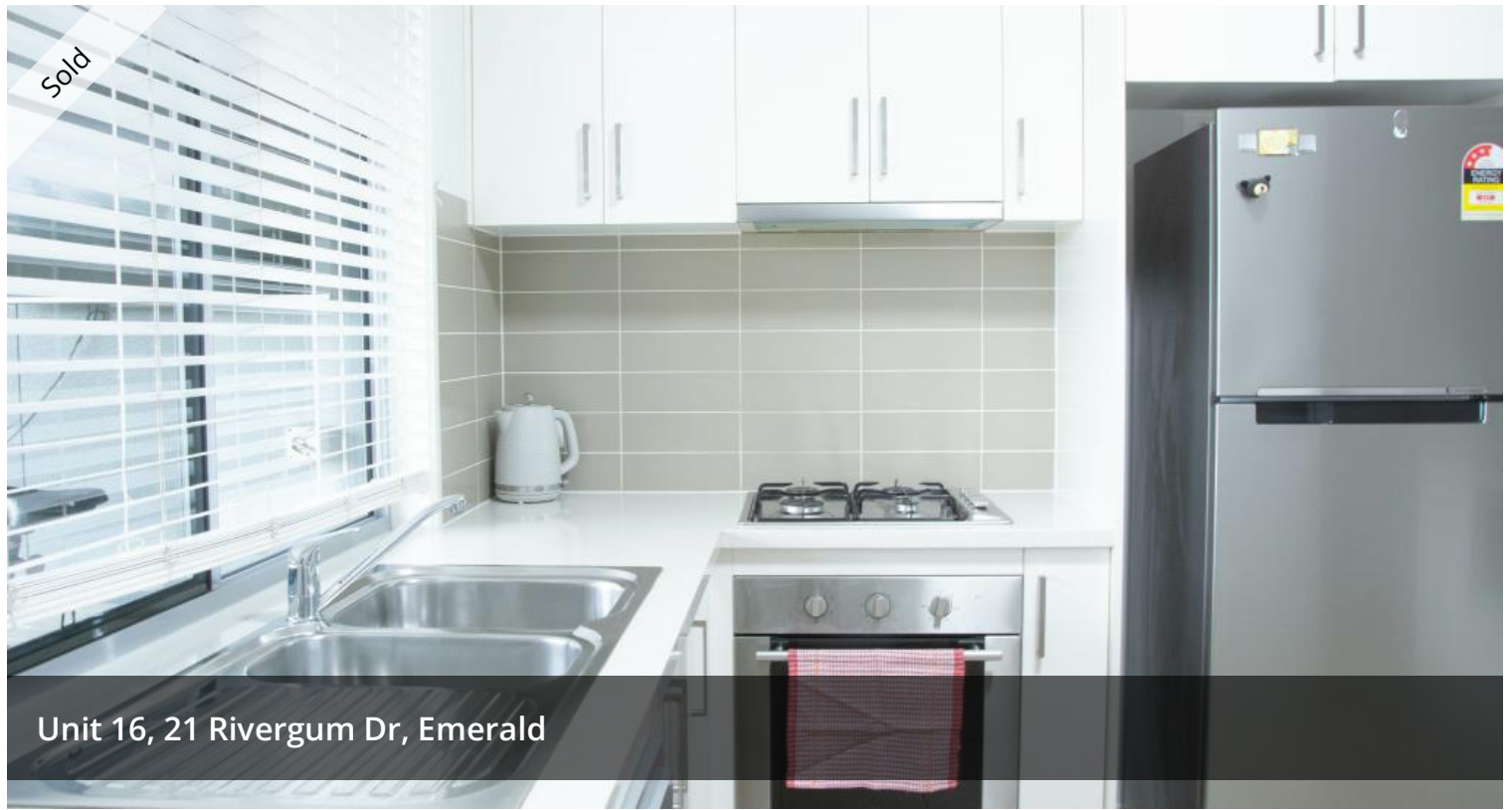
Unit 16, 21 Rivergum Dr, Emerald