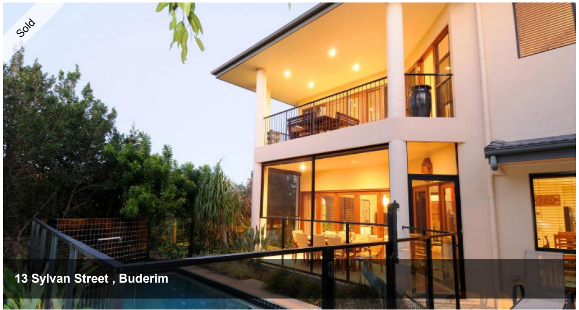
13 Sylvan Street , Buderim