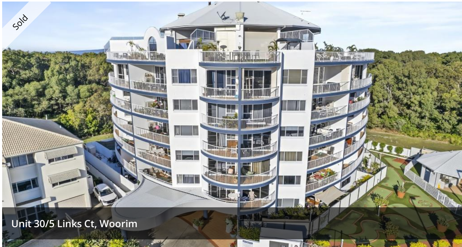
Unit 30/5 Links Ct, Woorim