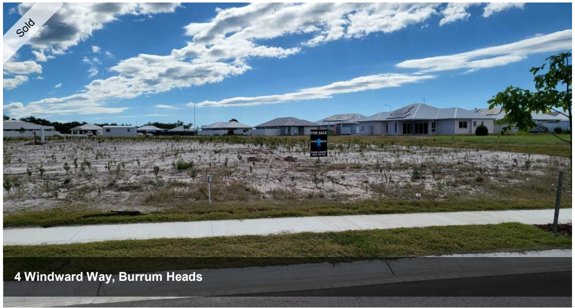
4 Windward Way, Burrum Heads