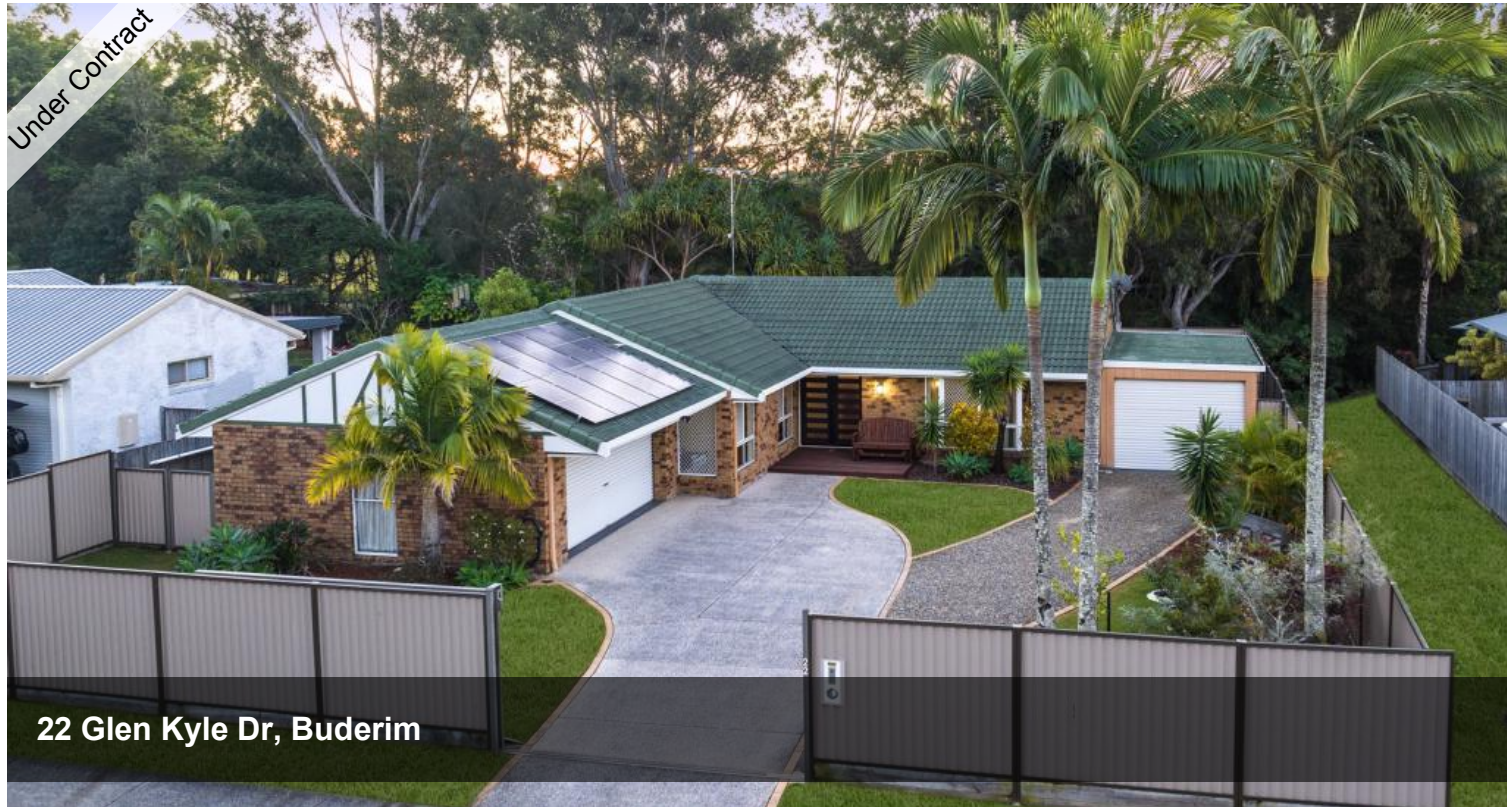
22 Glen Kyle Dr, Buderim