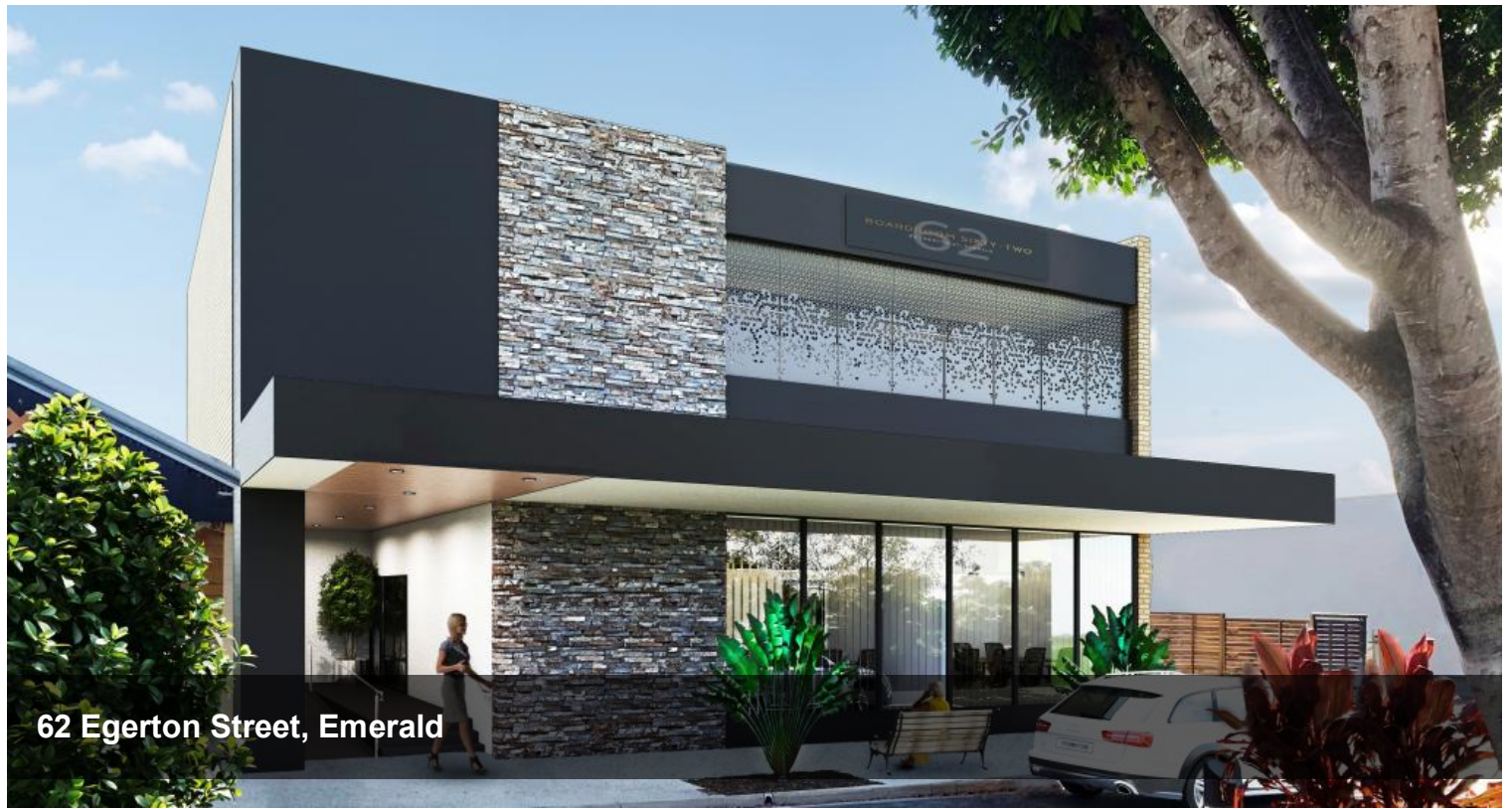
62 Egerton Street, Emerald