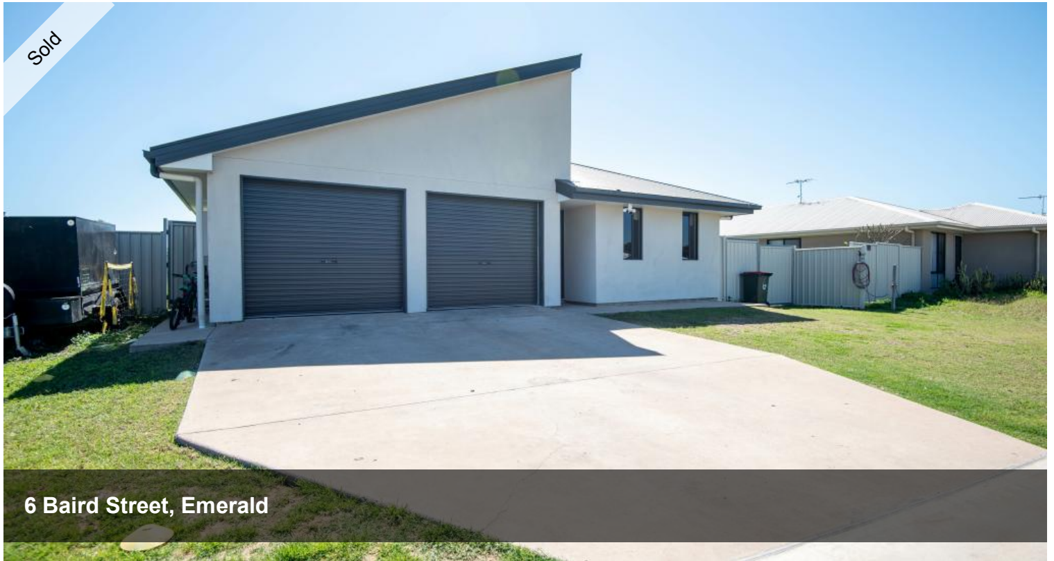
6 Baird Street, Emerald