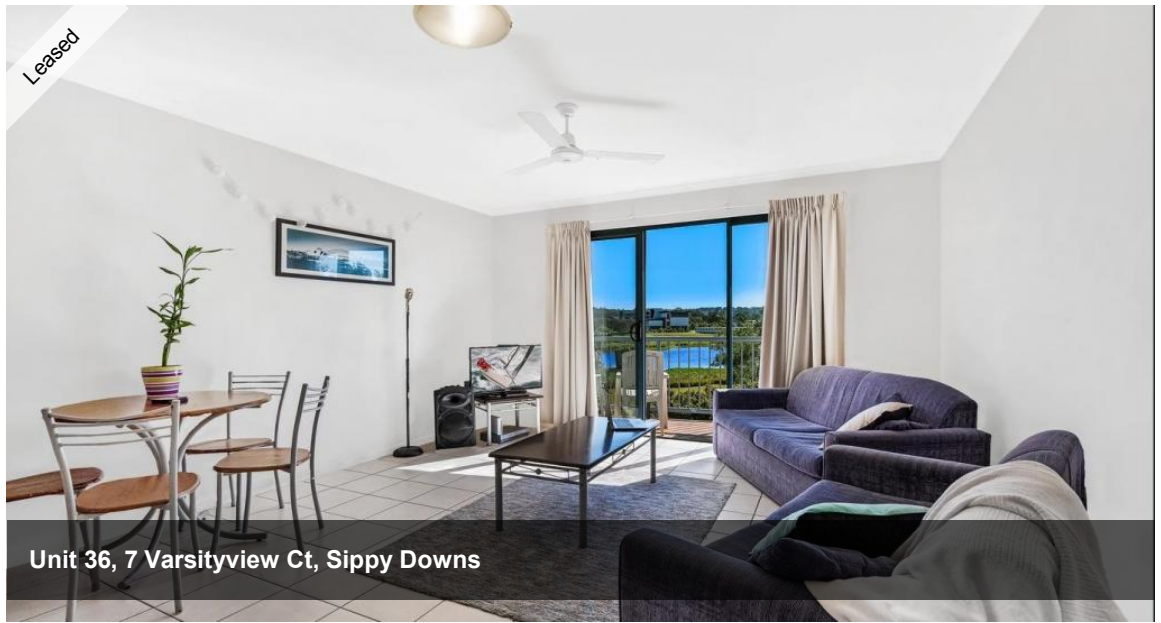
Unit 36, 7 Varsityview Ct, Sippy Downs