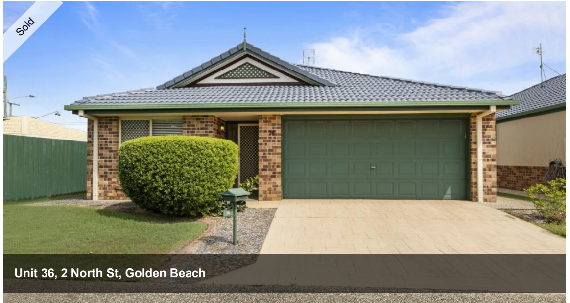
Unit 36, 2 North St, Golden Beach