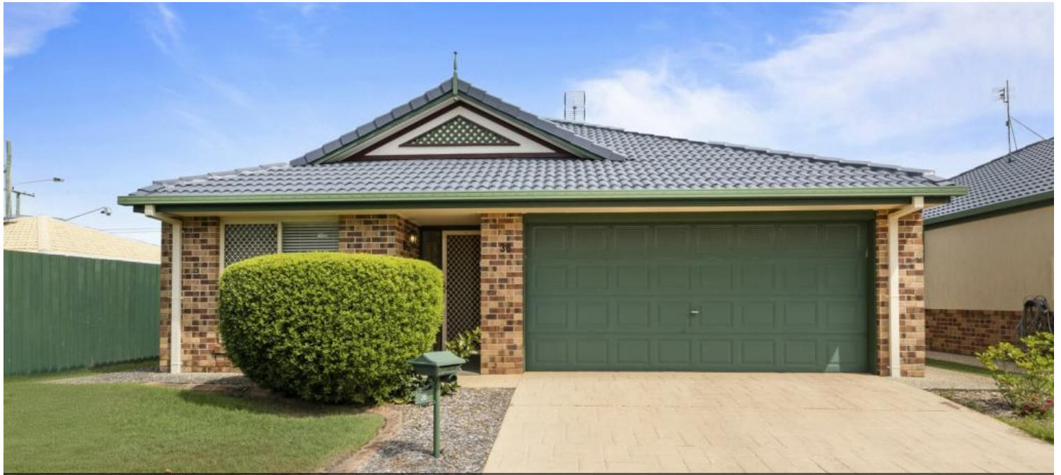
Unit 36, 2 North St, Golden Beach