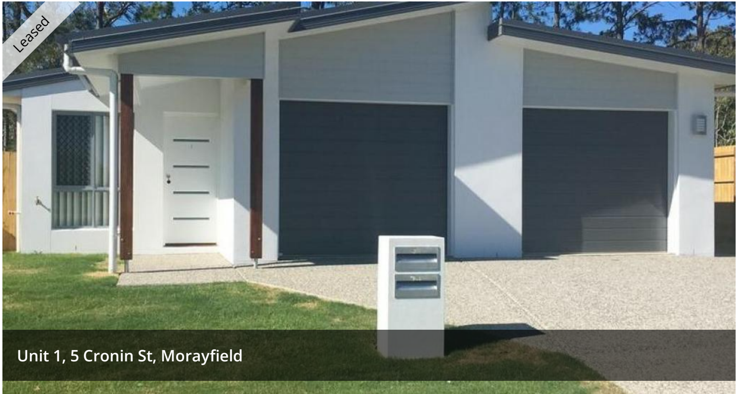
Unit 1, 5 Cronin St, Morayfield