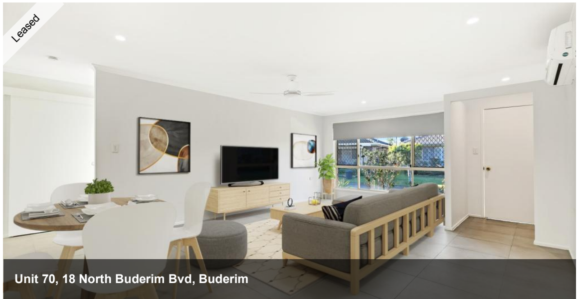
Unit 70, 18 North Buderim Blvd, Buderim