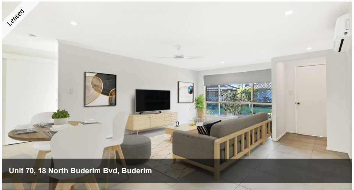
Unit 70, 18 North Buderim Bvd, Buderim