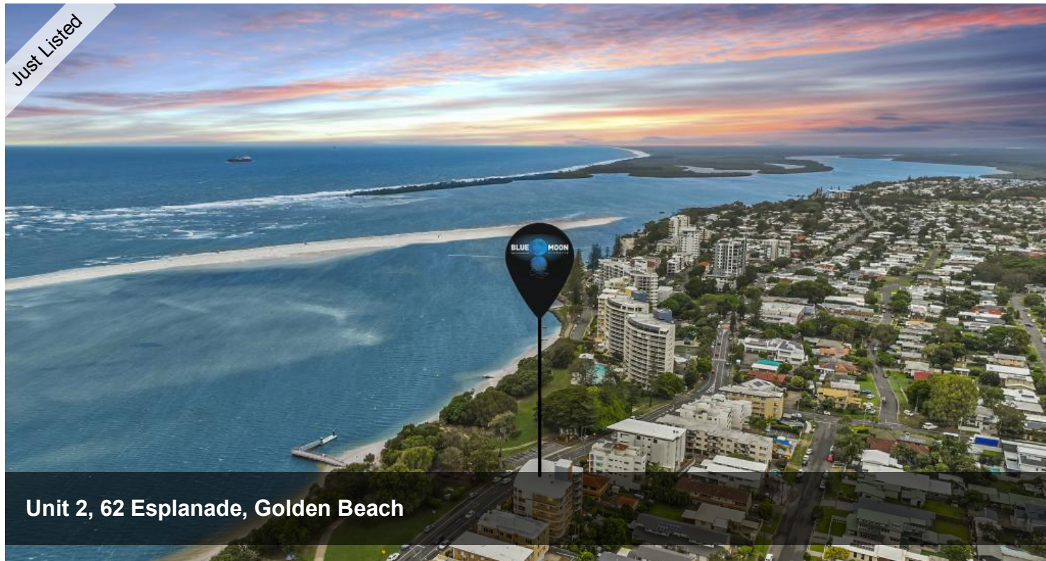
Unit 2, 62 Esplanade, Golden Beach