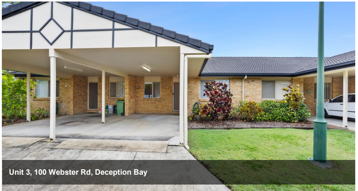
Unit 3, 100 Webster Rd, Deception Bay