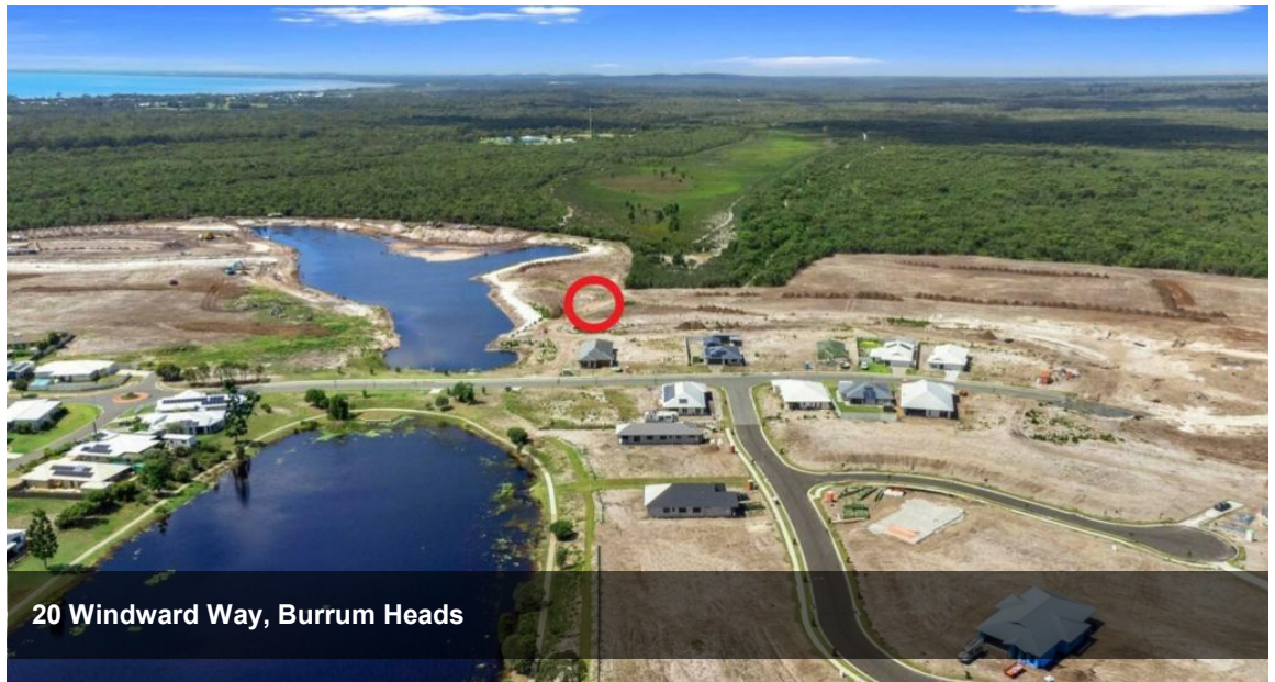
20 Windward Way, Burrum Heads