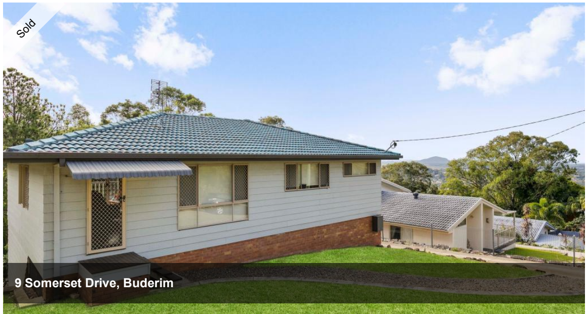
9 Somerset Drive, Buderim