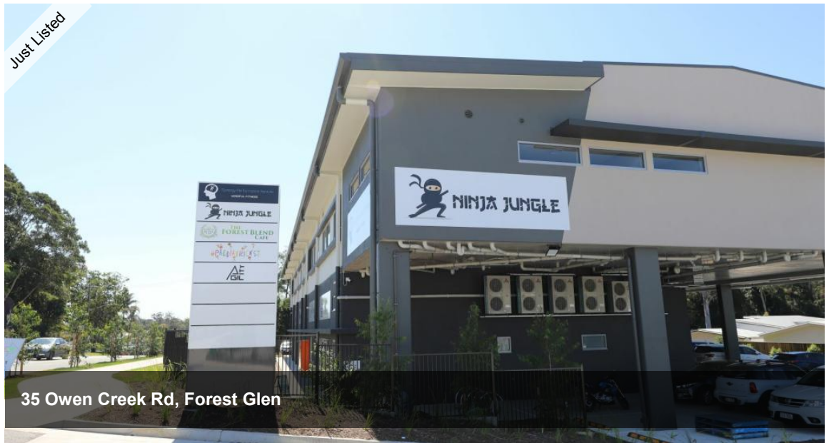
35 Owen Creek Rd, Forest Glen