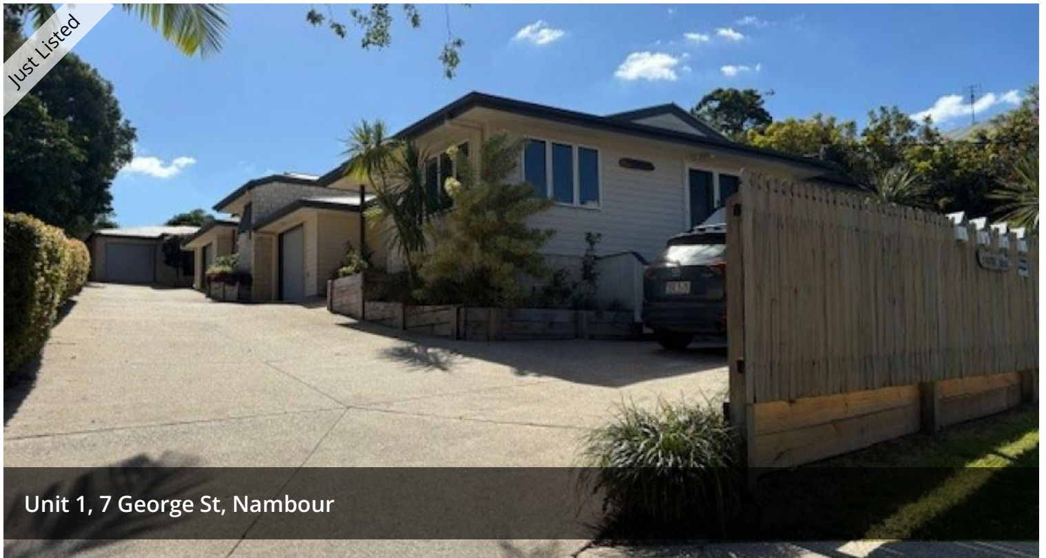
Unit 1, 7 George St, Nambour