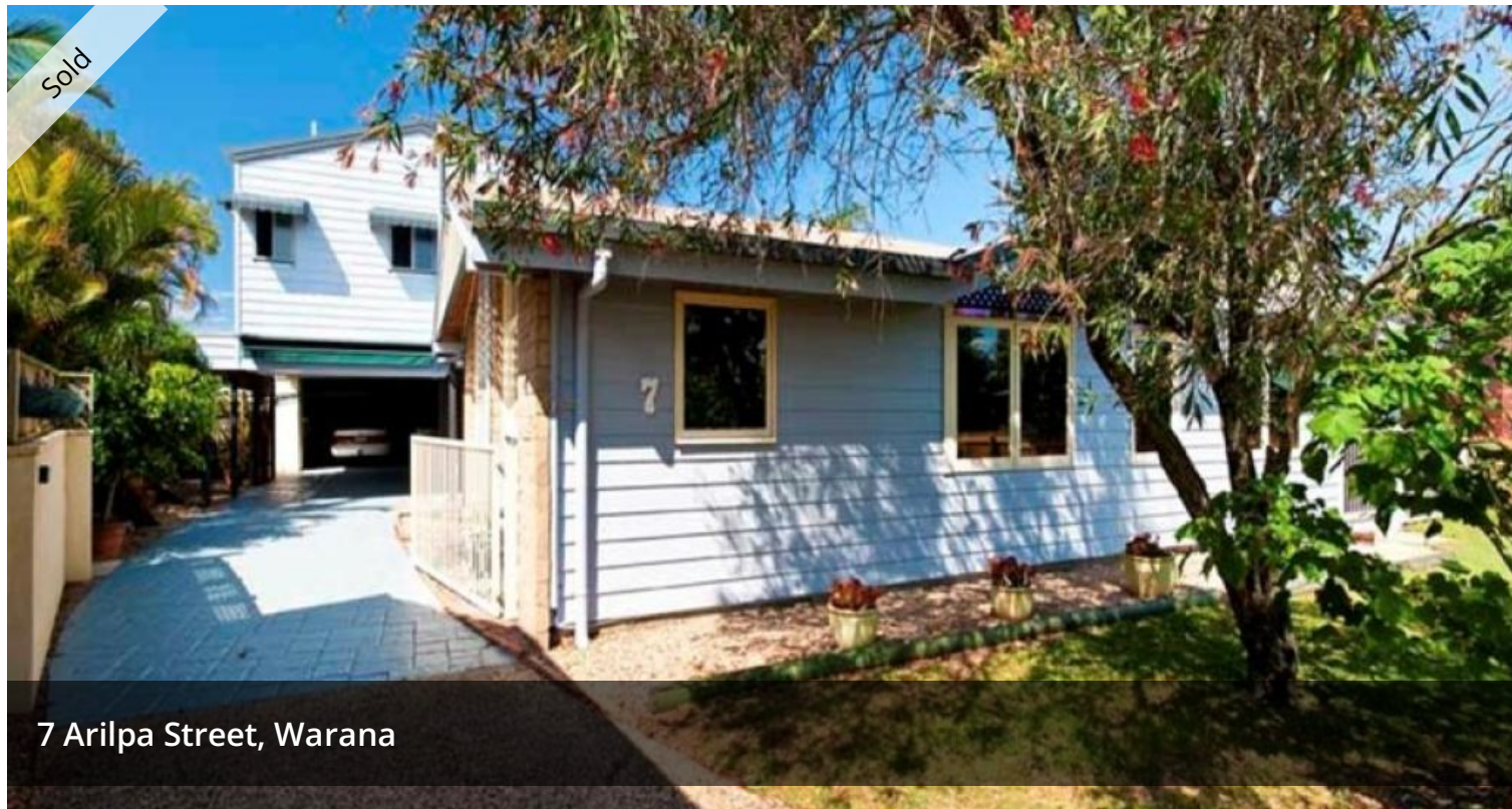
7 Arilpa Street, Warana