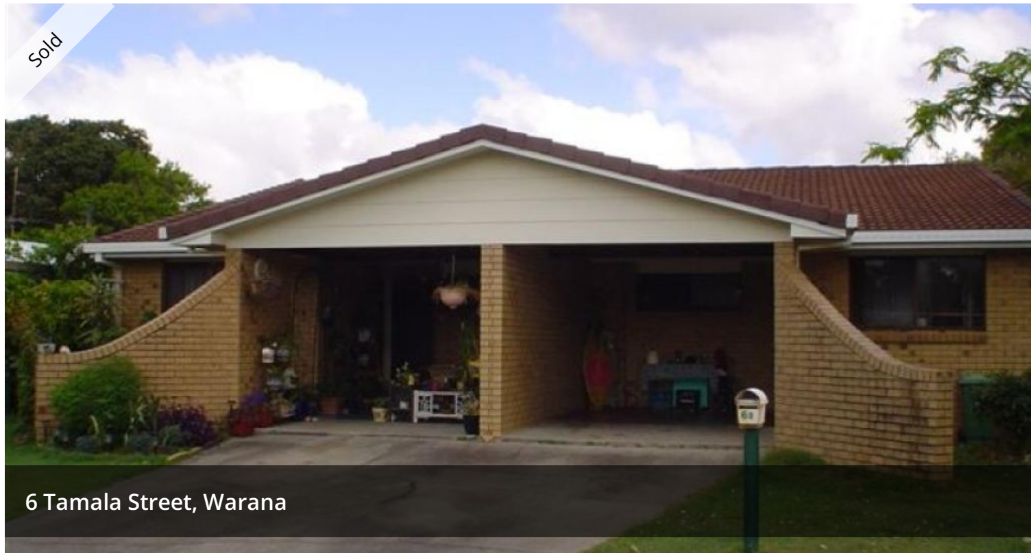
6 Tamala Street, Warana