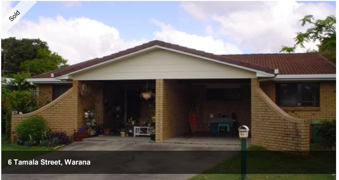
6 Tamala Street, Warana