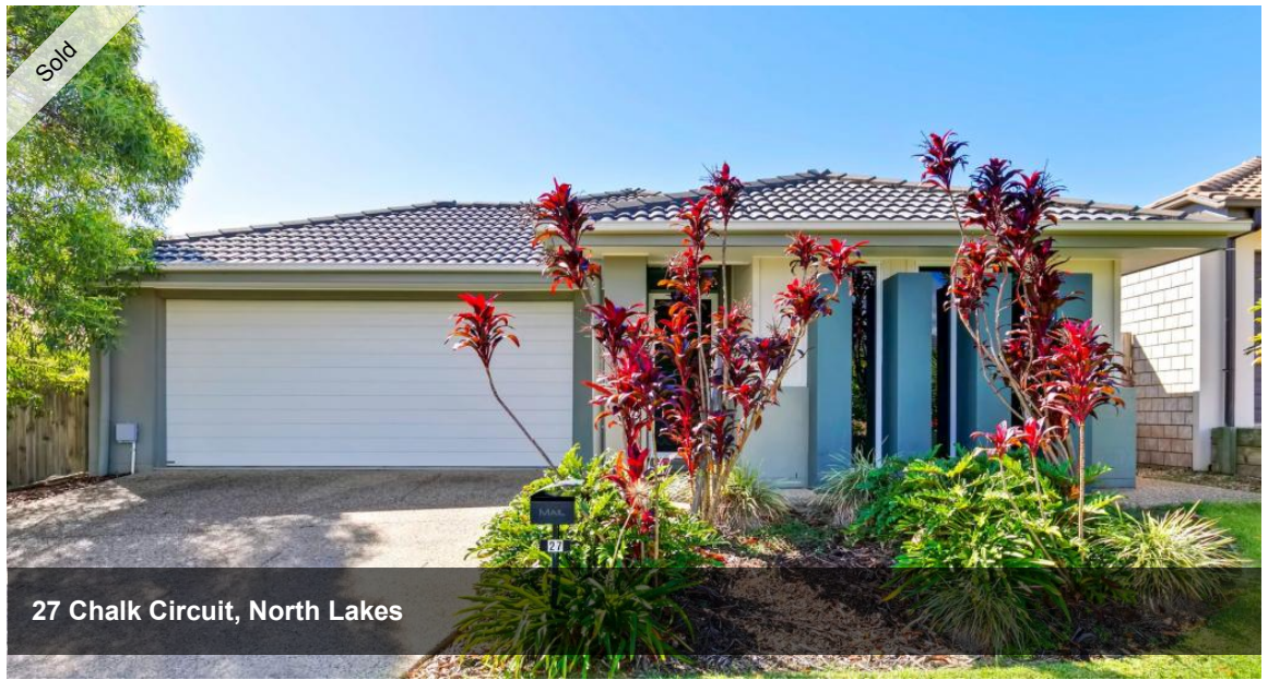
27 Chalk Circuit, North Lakes