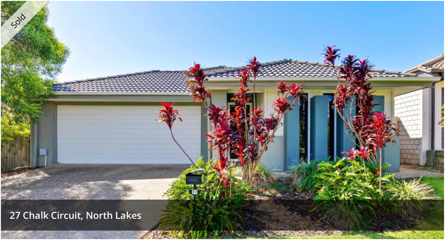
27 Chalk Circuit, North Lakes