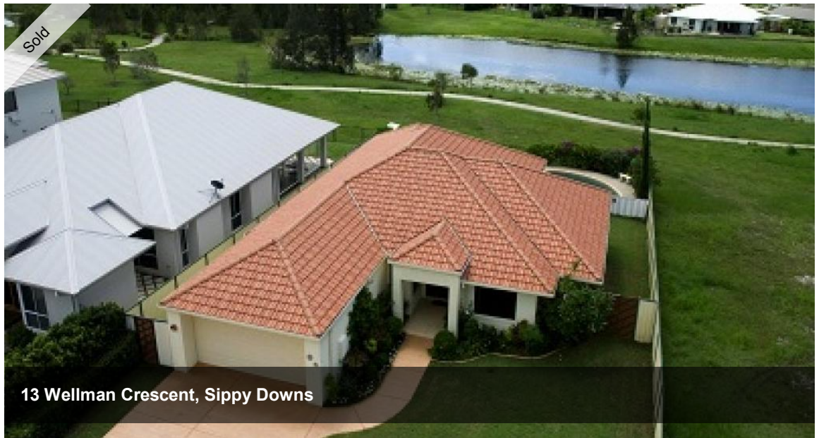
13 Wellman Crescent, Sippy Downs