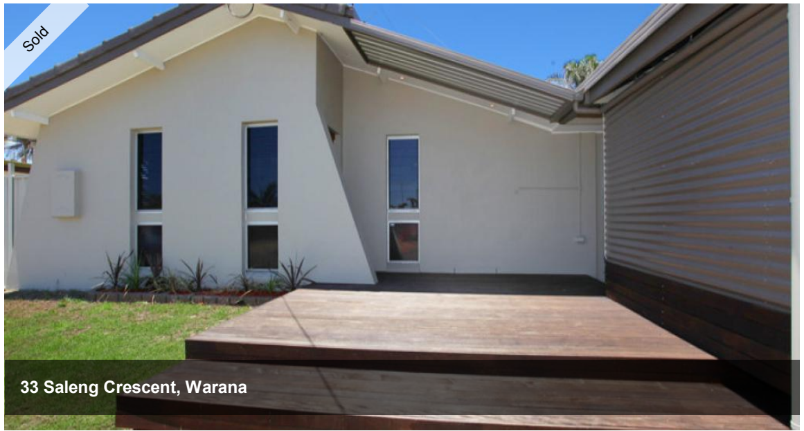
33 Saleng Crescent, Warana