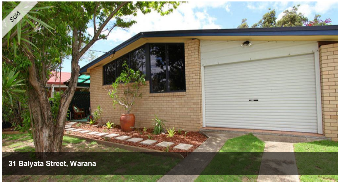
31 Balyata Street, Warana