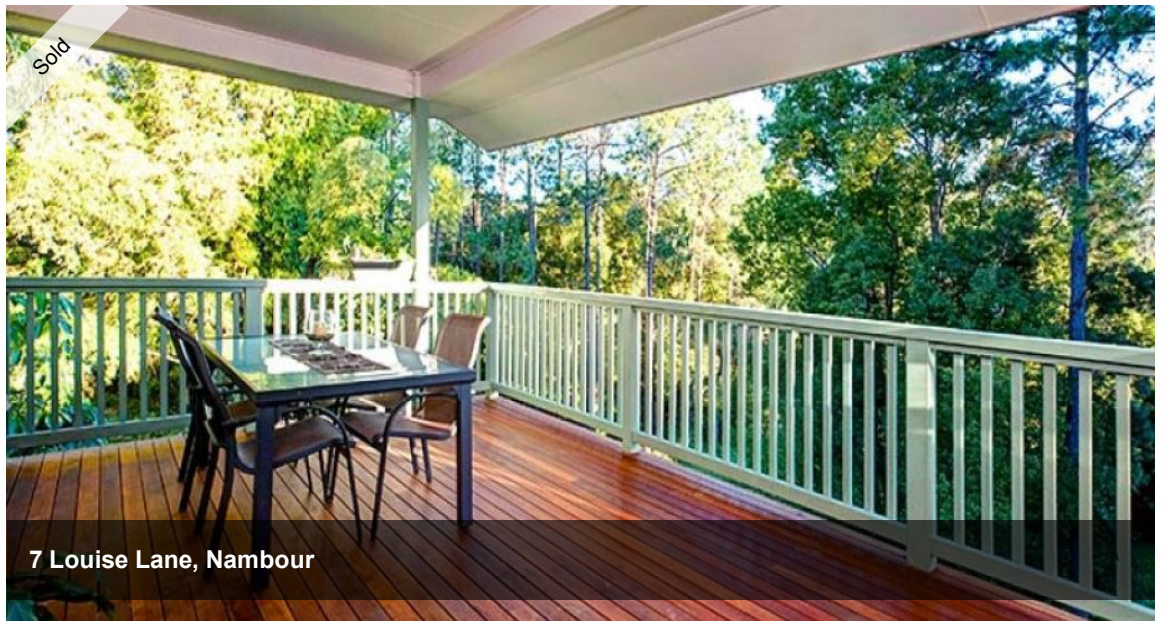
7 Louise Lane, Nambour