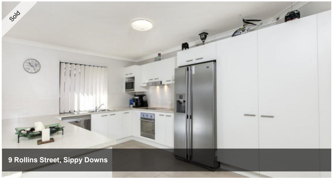
9 Rollins Street, Sippy Downs