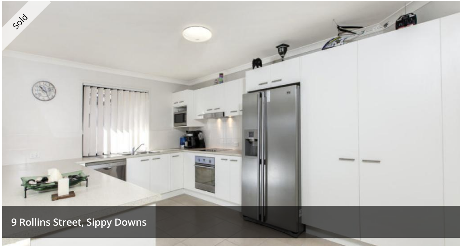
9 Rollins Street, Sippy Downs