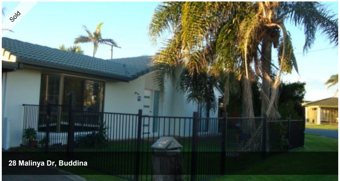
28 Malinya Dr, Buddina