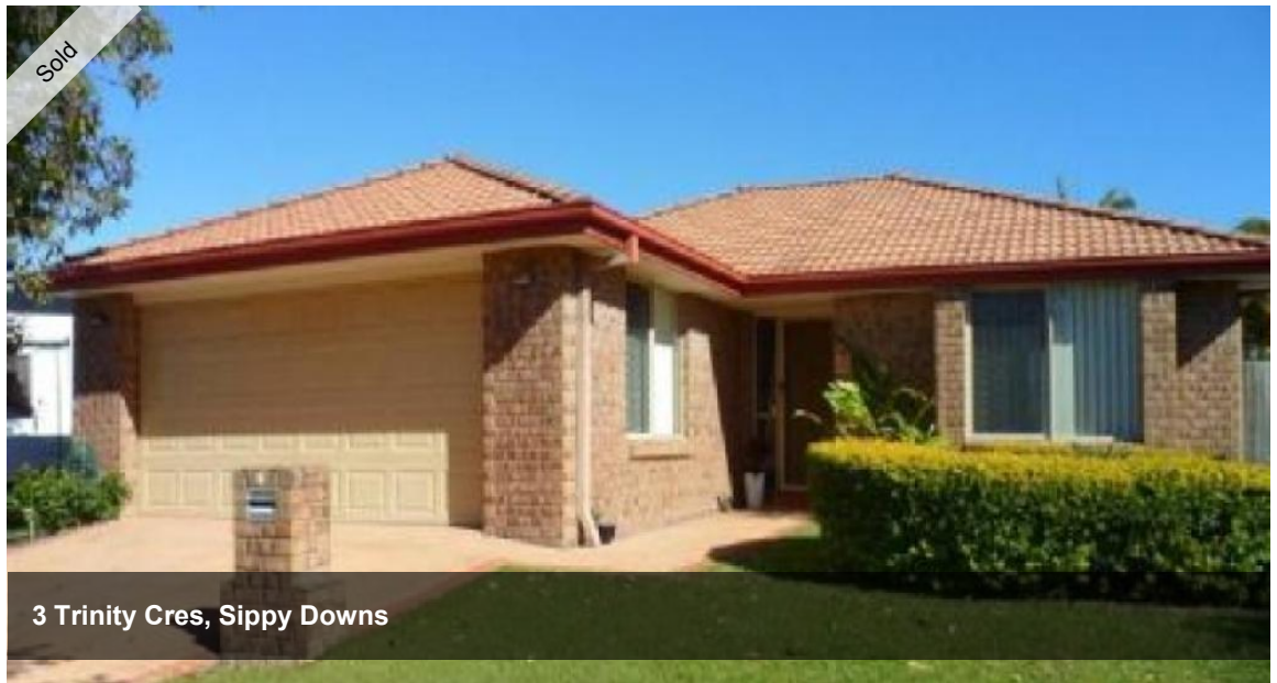
3 Trinity Cres, Sippy Downs