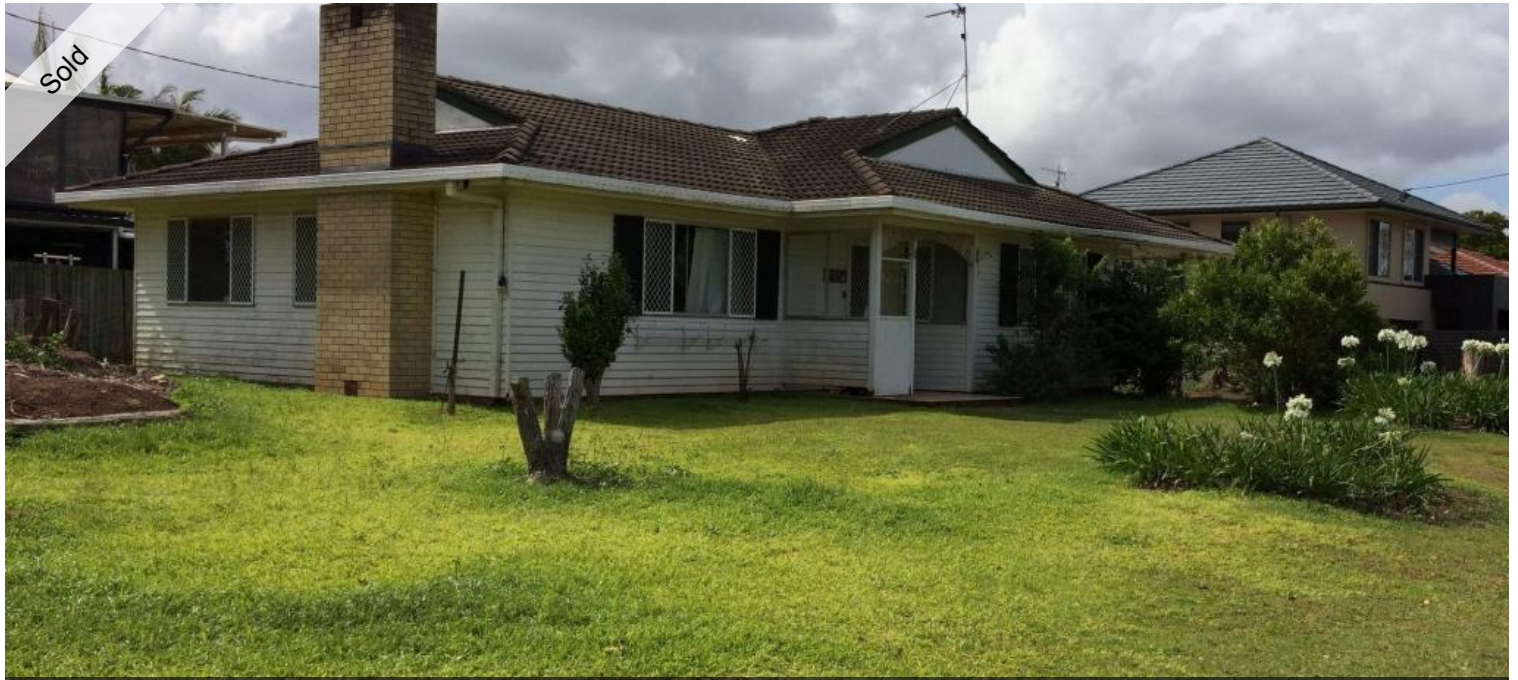
1 Feeley Street, Buderim