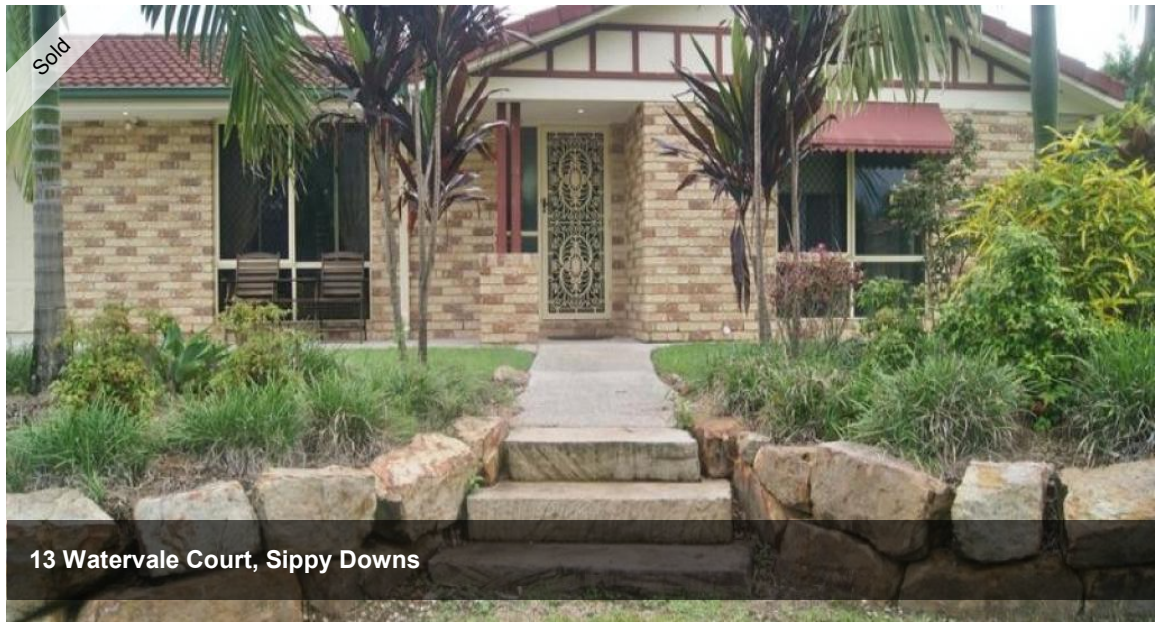
13 Watervale Court, Sippy Downs