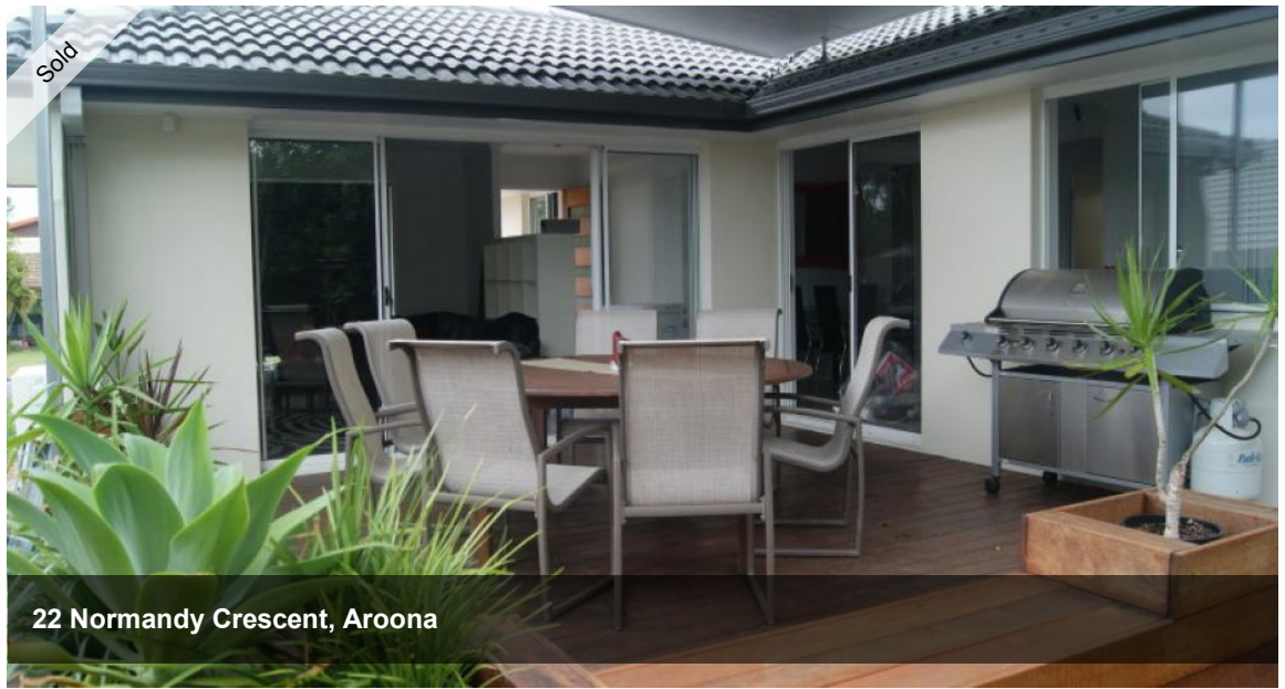
22 Normandy Crescent, Arona