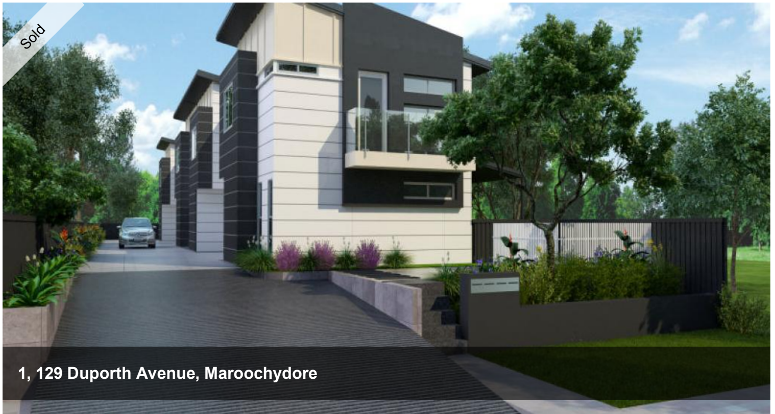
1, 129 Duporth Avenue, Maroochydore