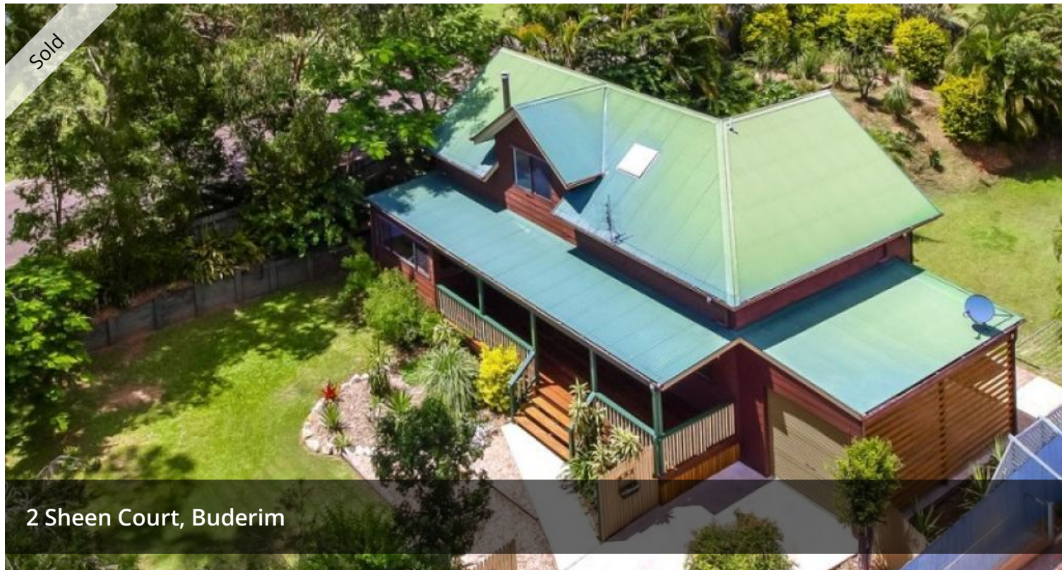
2 Sheen Court, Buderim