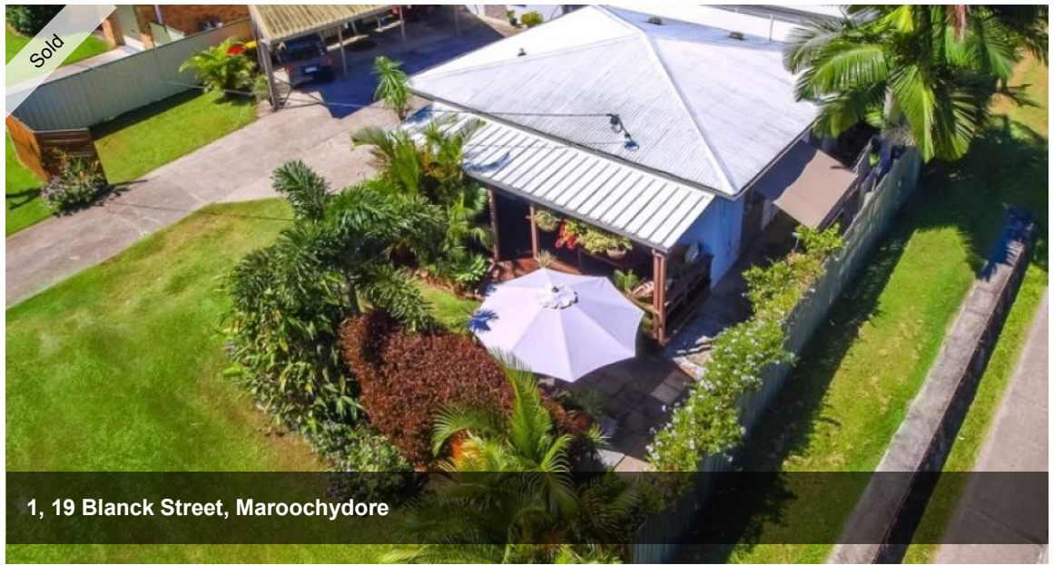
1, 19 Blanck Street, Maroochydore