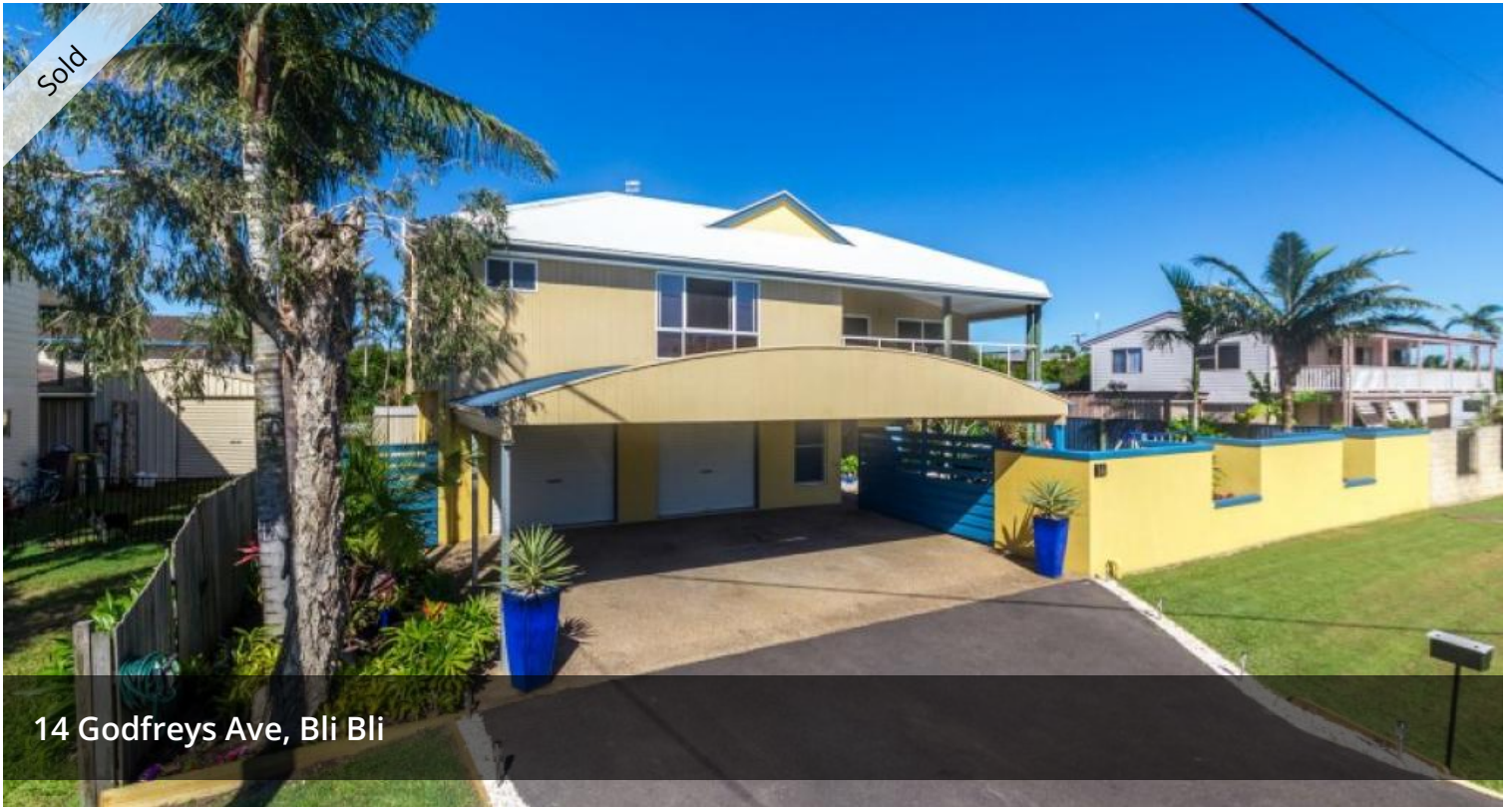
14 Godfreys Ave, Bli Bli