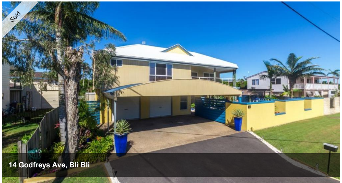
14 Godfreys Ave, Bli Bli