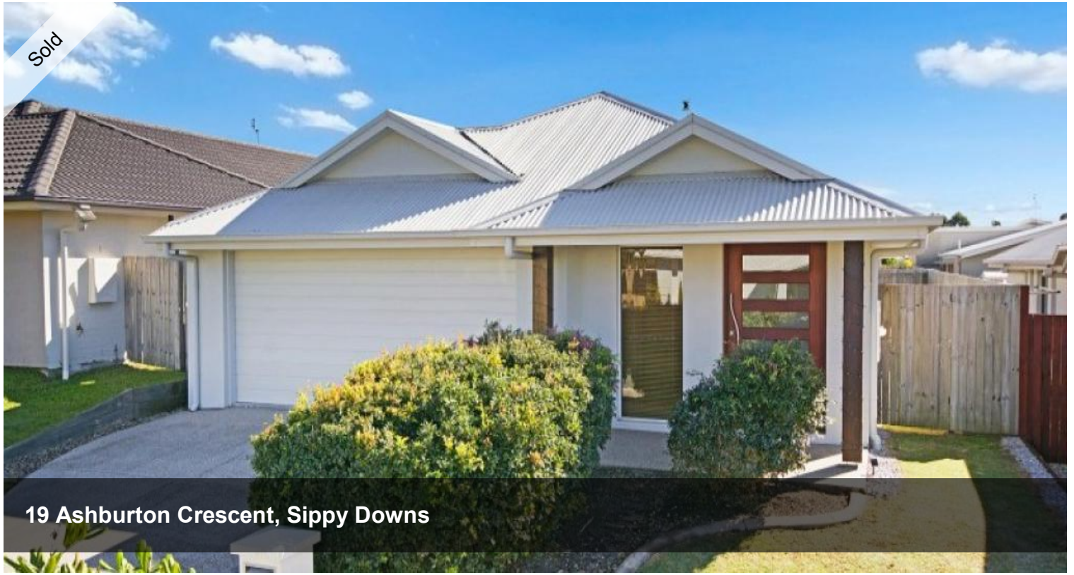
19 Ashburton Crescent, Sippy Downs