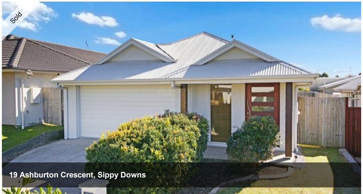
19 Ashburton Crescent, Sippy Downs