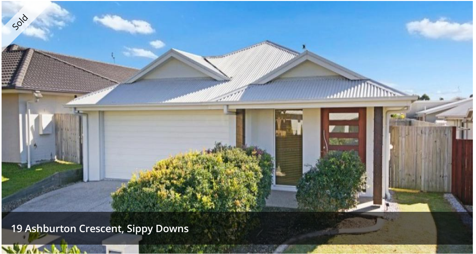
19 Ashburton Crescent, Sippy Downs