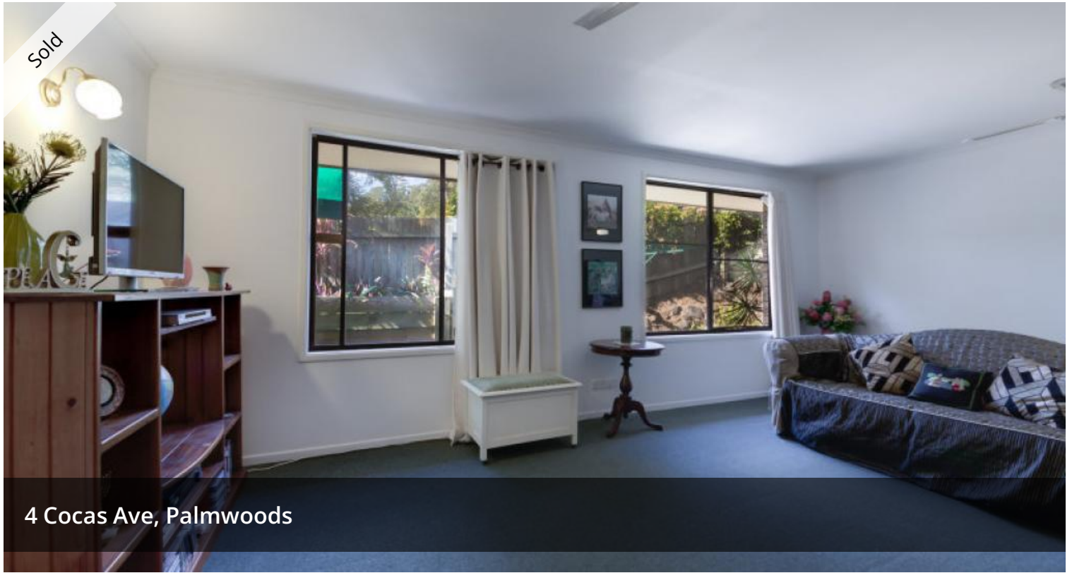
4 Cocas Ave, Palmwoods