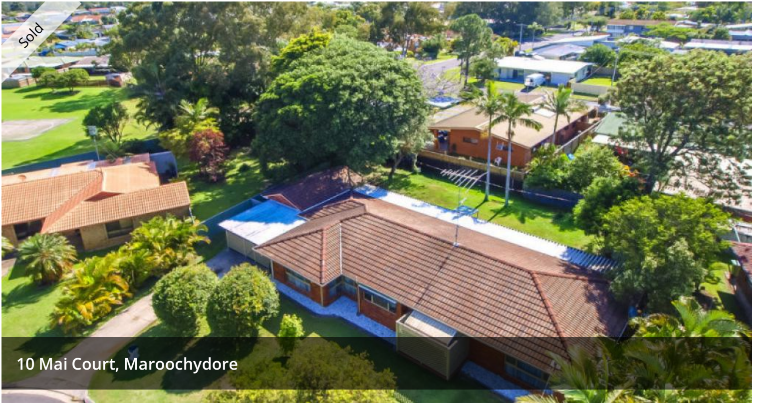
10 Mai Court, Maroochydore