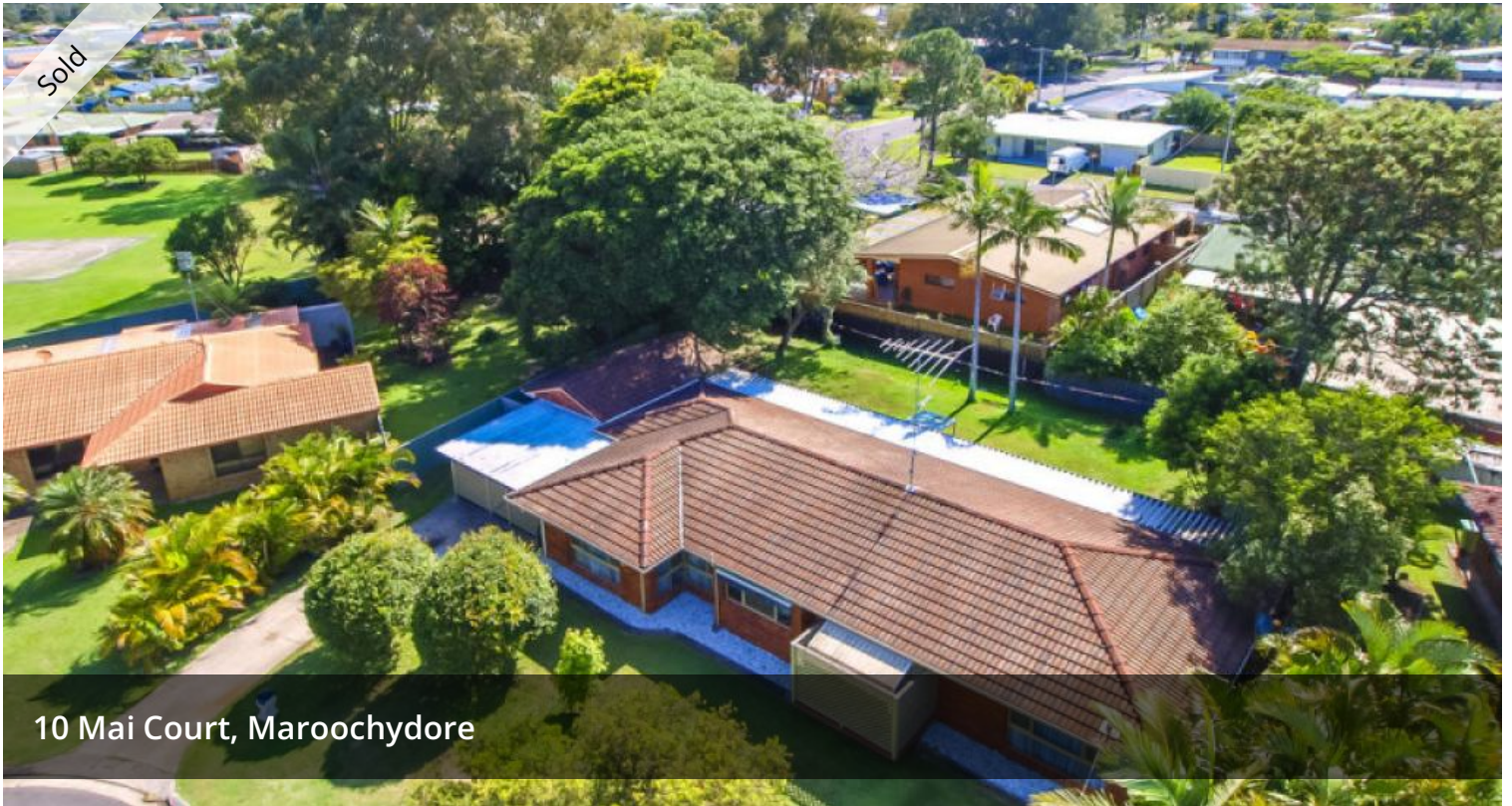
10 Mai Court, Maroochydore