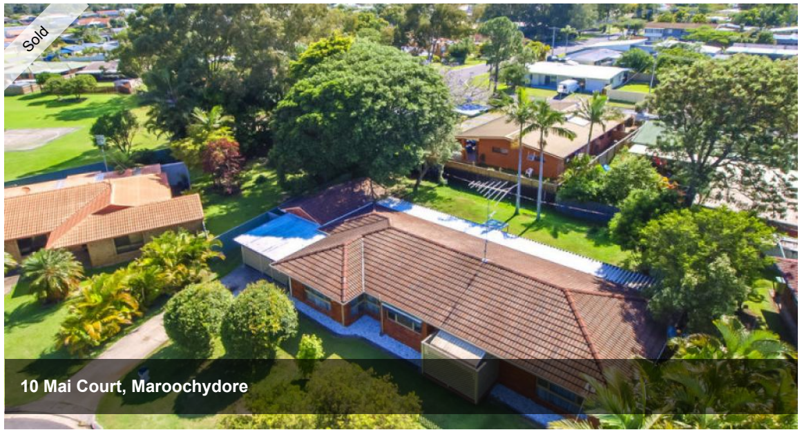
10 Mai Court, Maroochydore