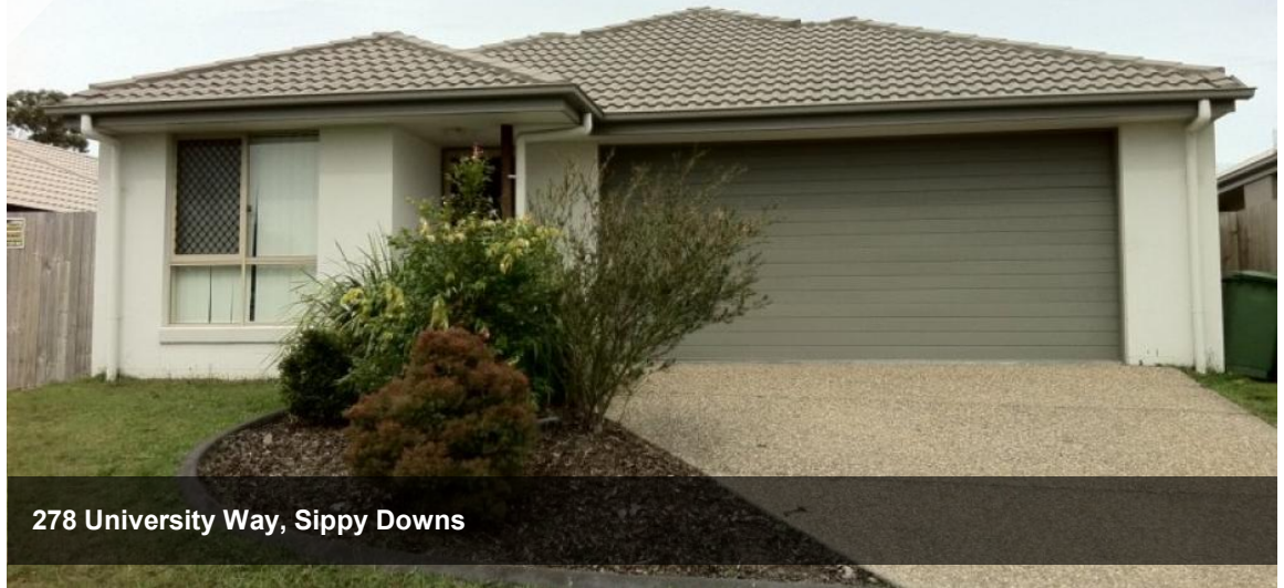
278 University Way, Sippy Downs