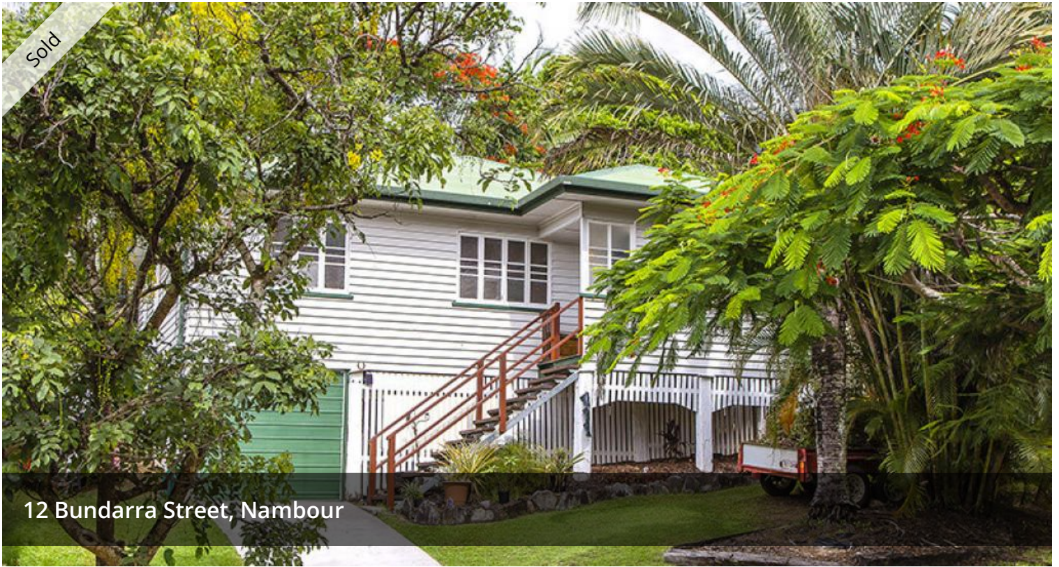
12 Bundarra Street, Nambour