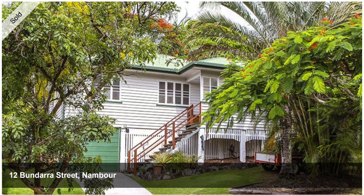
12 Bundarra Street, Nambour